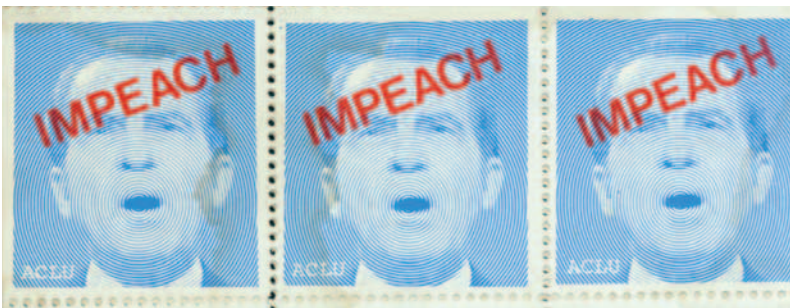
Detail from a page of "Impeach Nixon" stamps, early 1970s.