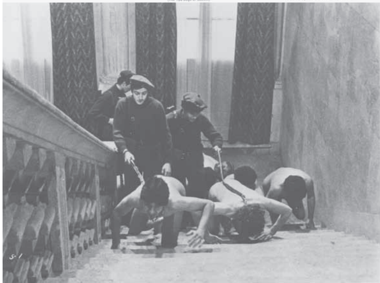
PIER PAOLO PASOLINI'S SALO (The 120 days of Sodom)