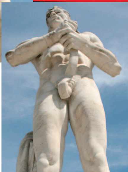
At Fascist dictator Benito Mussolini's Foro Italico, Rome, each statue is twelve feet tall on a six-foot pedestal. "Statue of Boxer Primo Carnera #1," and "Statue of Primo Carnera #2." Inset: Statue of Primo Carnera on the cover of the first edition of Some Dance to Remember: A Memoir-Novel of San Francisco 1970-1982.