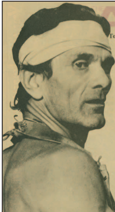
"Pier Paolo Pasolini," 1974, publicity photograph.