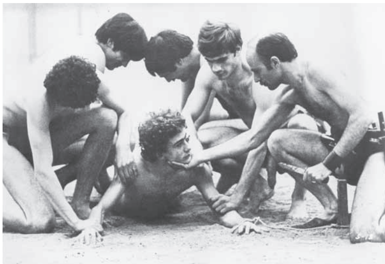
PIER PAOLO PASOLINI'S SALO (The 120 days of Sodom)