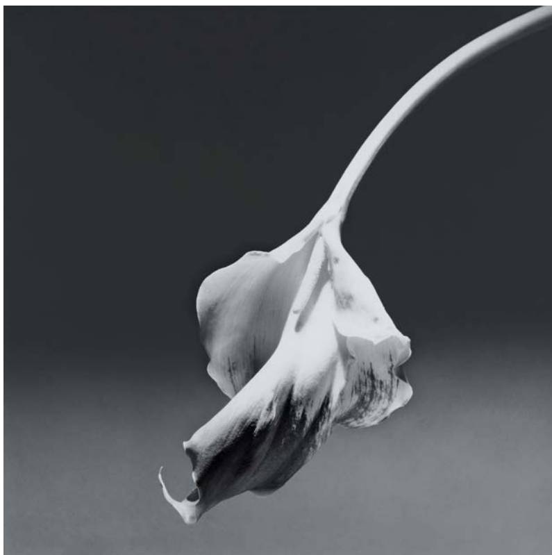
Robert Mapplethorpe, "Calla Lily," 1986. Gelatin silver print, Solomon R. Guggenheim Museum, New York. Gift, The Robert Mapplethorpe Foundation.