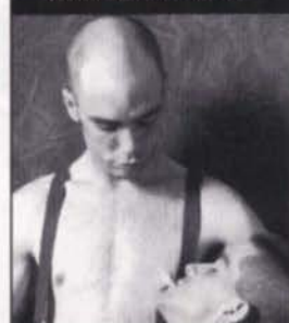
BRITISH NEO-FAGS - PG. 50