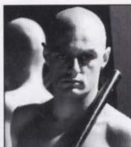
LAY ME SOME SKIN - PG. 27