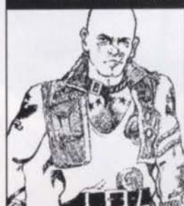
MASTER KEY - PG. 33