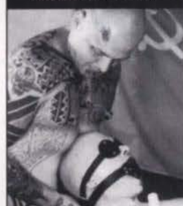
SKIN MASTER - PG. 38