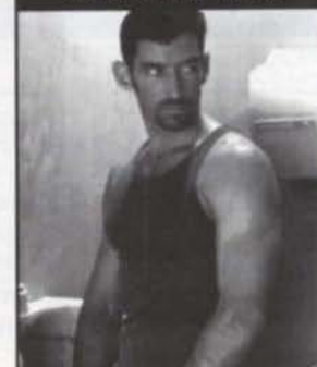
ON YOU KNEES - PG. 26