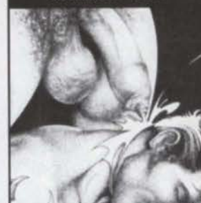
TRUCKIN'... - PG. 42