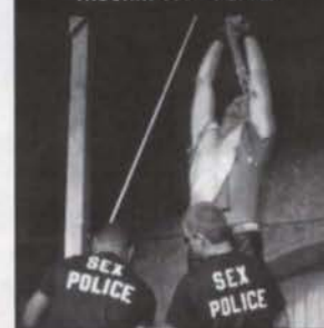
MR. DRUMMER - PG. 51