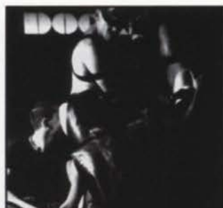
PARIS - PG 14