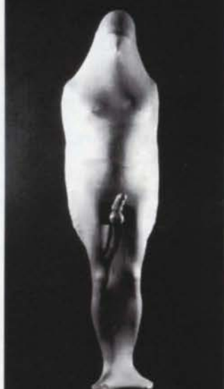
STRETCHING THE LIMITS - PG 48