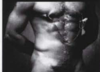
TIT TORTURE - PG 18