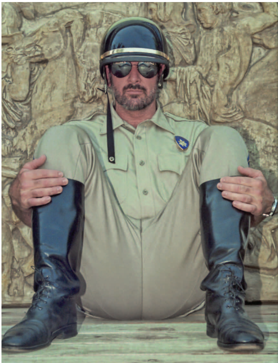
“What Wraps around a Motorcycle”

HOW TO LEGALLY QUOTE FROM THIS BOOK