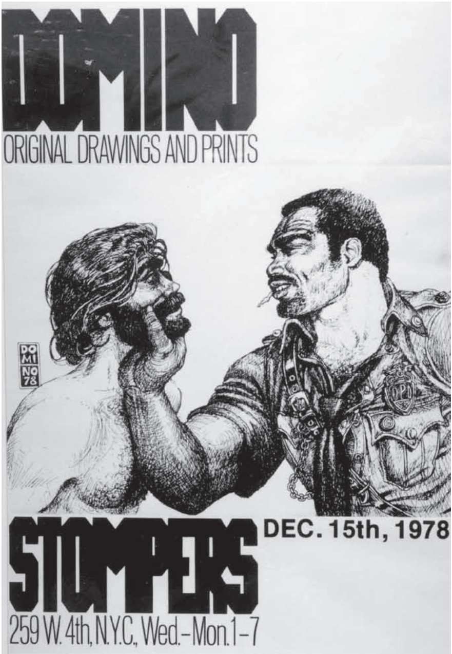
Photograph of Poster—Video: Domino Video Gallery